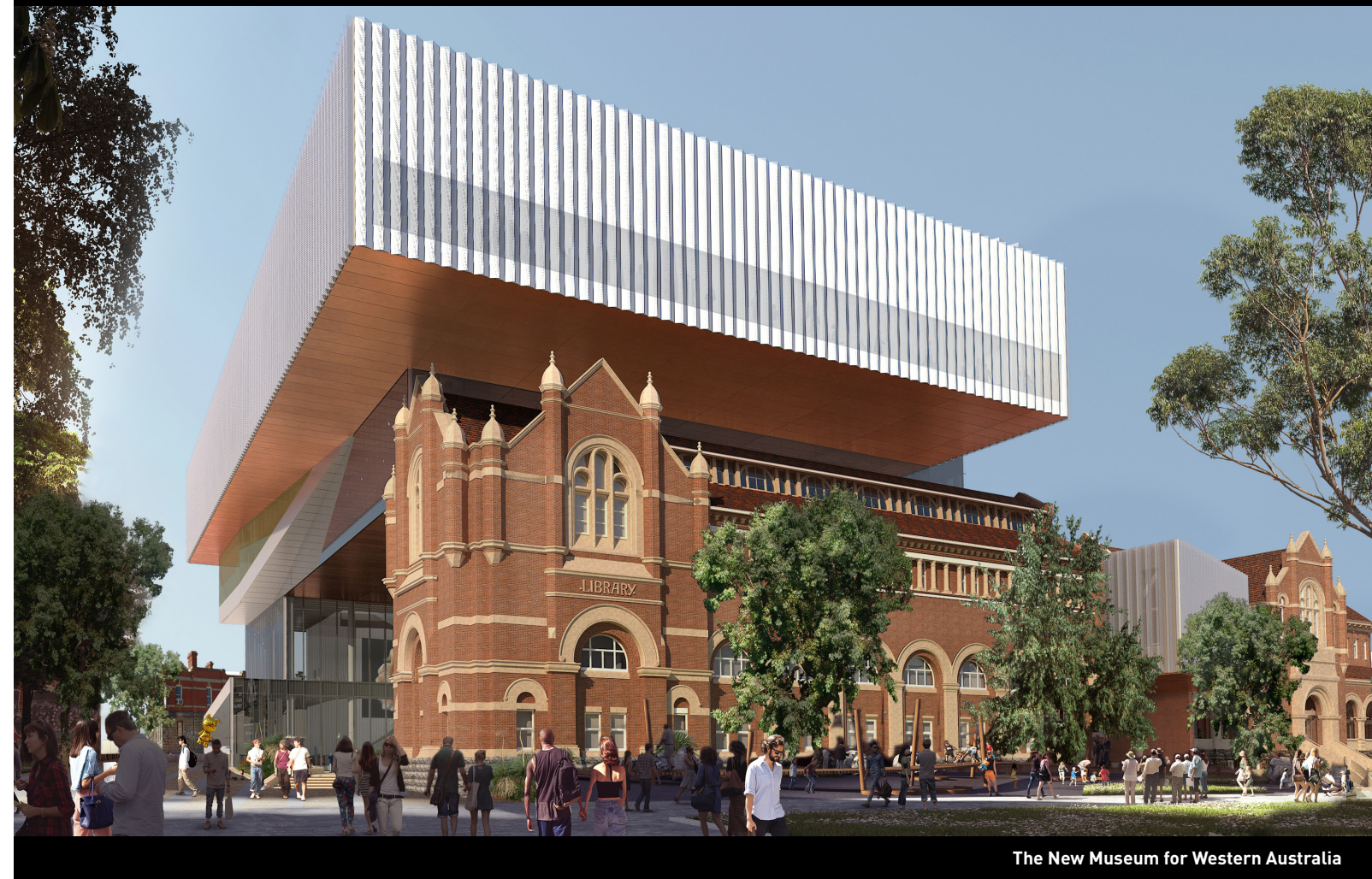
The New Museum for Western Australia

Our new world-class museum will be the heart of our State and reflect the spirit of its people. It will be an important part of Perth's cultural precinct and be owned, visited and valued by all Western Australians and admired by the world – a major attraction for visitors to our State.